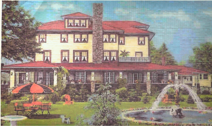
ANTRIM LODGE — ROSCOE, N.Y

The Antrim Lodge in Roscoe, NY has been a fixture in Sullivan County for over 120 years. After purchasing this historic landmark in 2002, and suffering a devastating fire in 2006, we have plans to restore it to its former glory. In addition to making Antrim Lodge a modern escape for travelers, it will include an event space for weddings and large gatherings, two dining areas, and the famous “Keener’s Pool” bar.